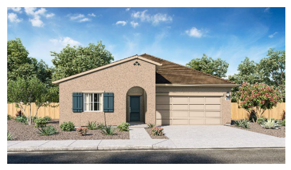
C - Mission