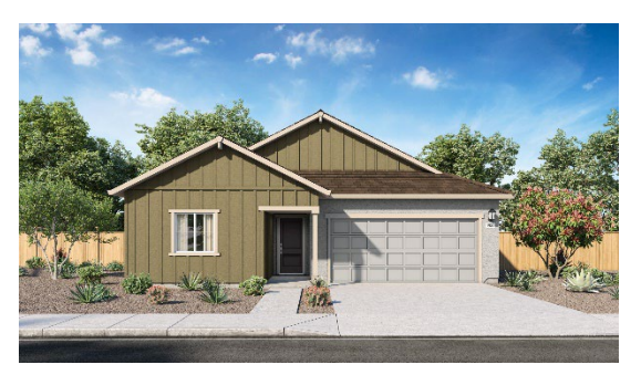
A - Farmhouse

2538 TISH TANG WAY REDDING, CA 96002 | DRHORTON.COM/SACRAMENTO