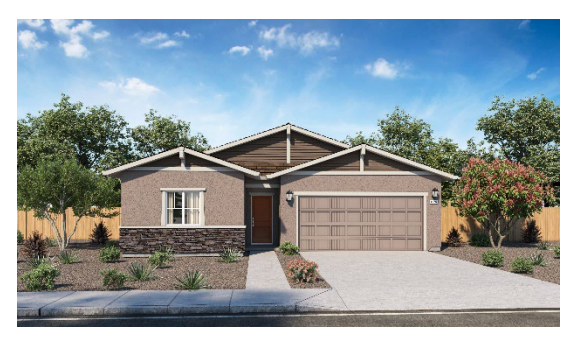
B - Craftsman